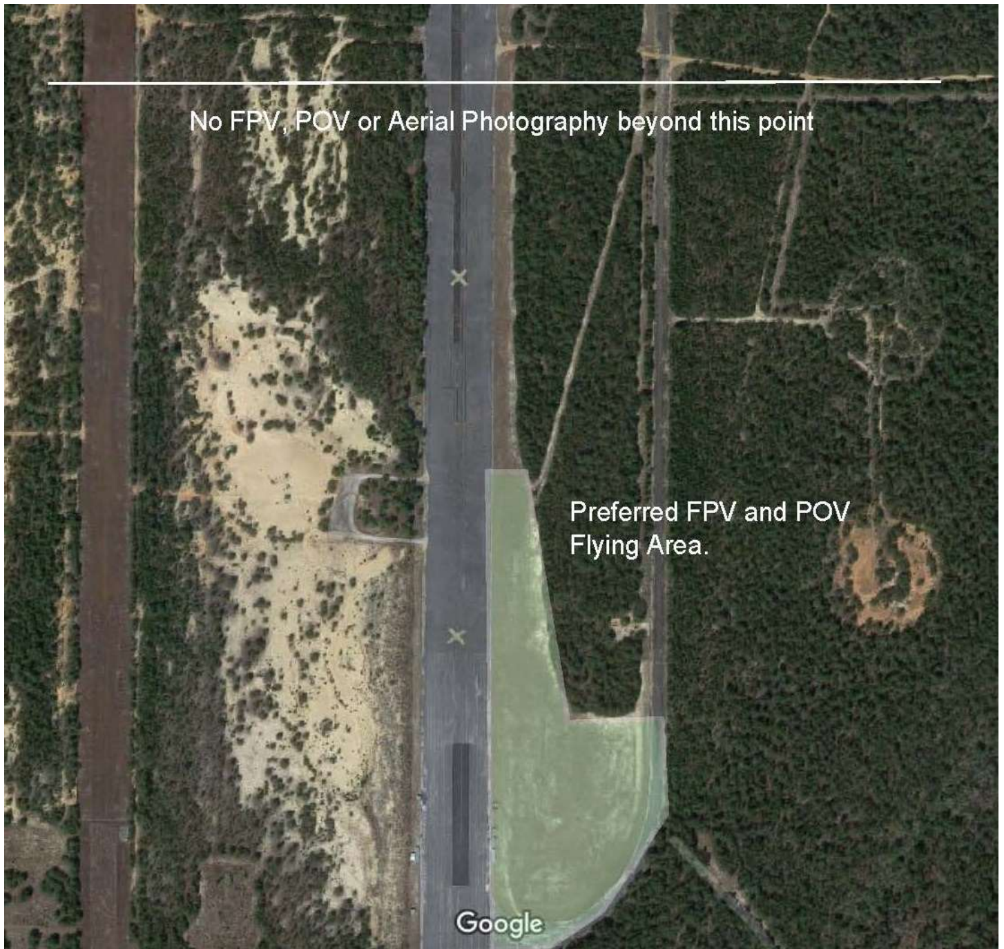
Figure 2: FPV, POV and Aerial Photography and Video Restriction Map